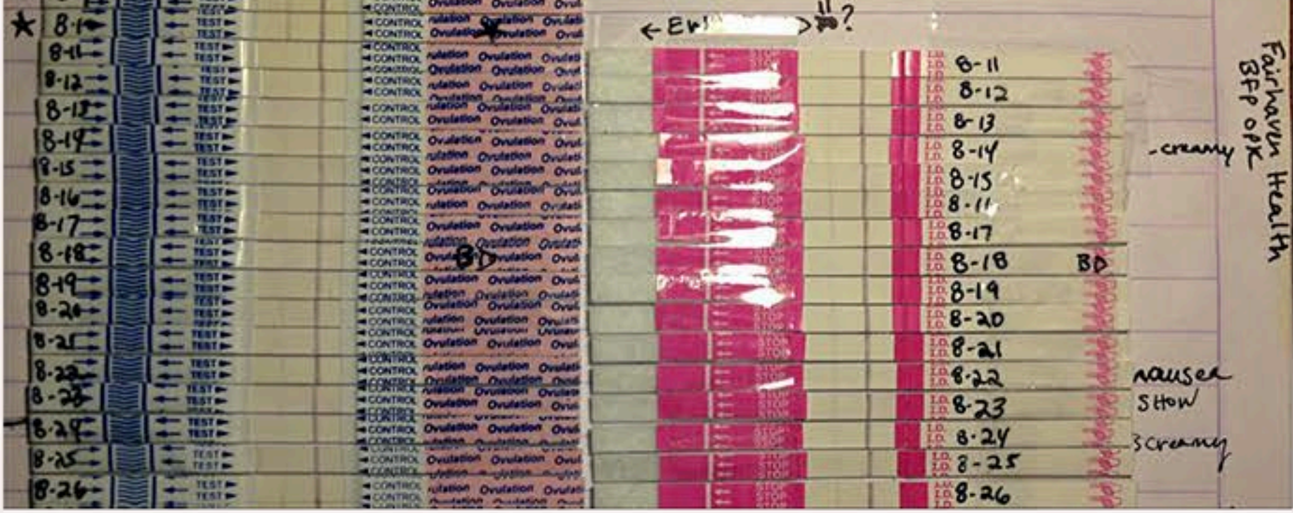
Figure : CD 11-27 comparing CVS and BFP brand OPKs.

Alas, at 14 days past ovulation (DPO), my OPKs were still negative. I waited for signs of my period or pregnancy, but I saw neither a positive HPT nor a spot of color. It is unlikely that I ovulated on August 10th. I tested out the remaining BFP OPK strips and was rewarded with another mini surge as my sticks grew darker again (see Figure D). Up until August 28th, both brands were comparable, being equally negative with slight hints of LH detected. However, on that day, the BFP strips showed up darker than the CVS, even though I was using the same urine sample at the same time each day. For six days, the BFP strips gave me almost-positives. I decided to count the 30th as possible ovulation for yet another two-week-wait for HPT testing.