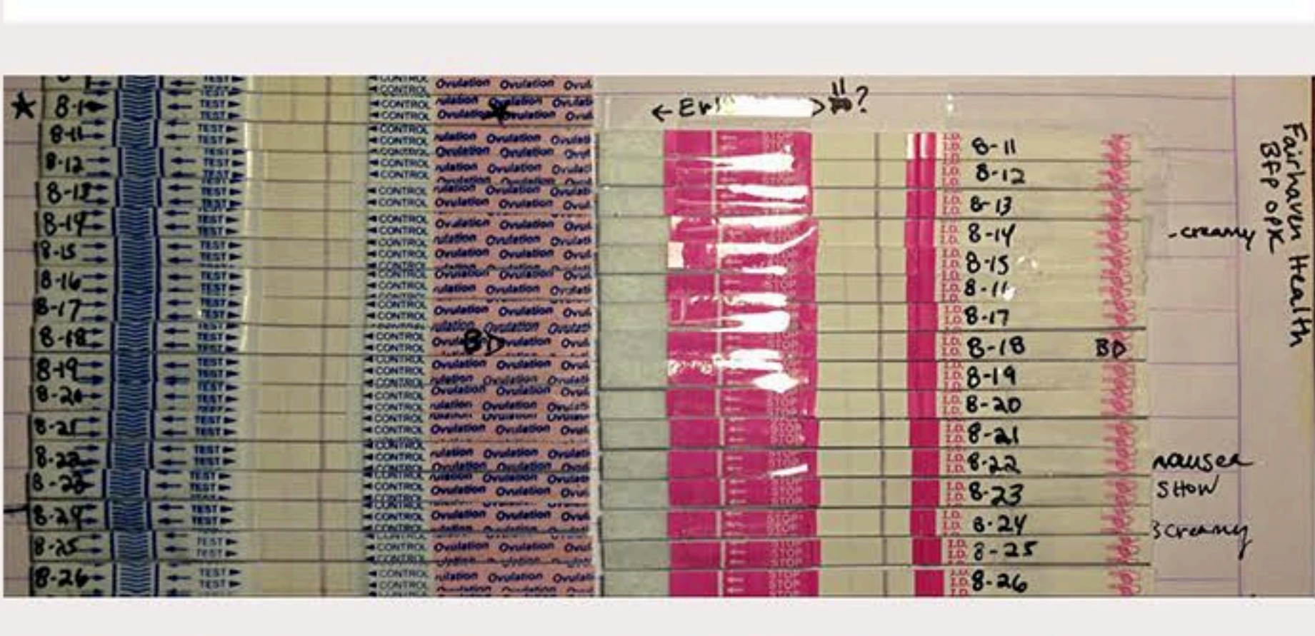
Figure : CVS, left, shows lighter than BFP, right.

On the 3rd, the BFP brand grew lighter again, and I experienced some spotting. At the time, I wasn't sure if it was another warning period or just breakthrough spotting. I've noticed it's common for women to have a mini-surge of LH right before their periods are due. If that was the case for me, you can see the mini-surge building up on the BFP strips. But the CVS brand is just kind of all over the place. If I were only using the CVS sticks, I would have been very confused and frustrated with the lack of direction on my stand. With BFP, I felt as though my hormones were going somewhere.