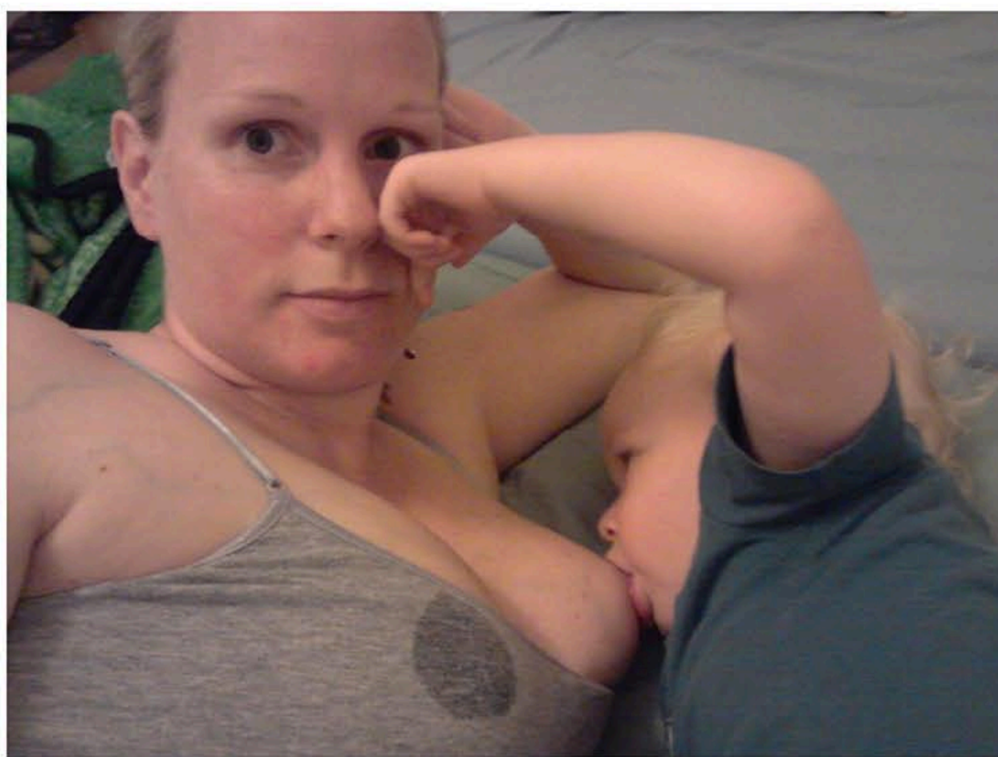
Ever had this problem? (The milk leakage, not the toddler left hook to the eye, although I'm sure many of you can relate to that too.)

Breastpads are great, but what if we could collect that milk that is being wasted and use it later? Some women leak as much as 4 ounces of milk per day. Depending on the age of your child that is more than one feeding! And we all know that breastmilk can be used for many other things such as skin care and a home remedy for just about any ailment. Breastmilk soaked in a shirt or pad is wasted breastmilk.