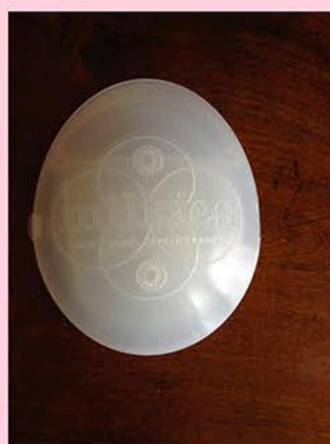
Milkies in the case

Milkies comes in a protective case that is great for storing your Milkies in when not in use. The case is a hard material to keep Milkies protected. The case also doubles as a stand. You can set Milkies in the case upright with milk inside. This is very helpful when you have a squirmy baby in your arms, when you need to put yourself back together after nursing, or when you need to grab a container to pour the milk into.