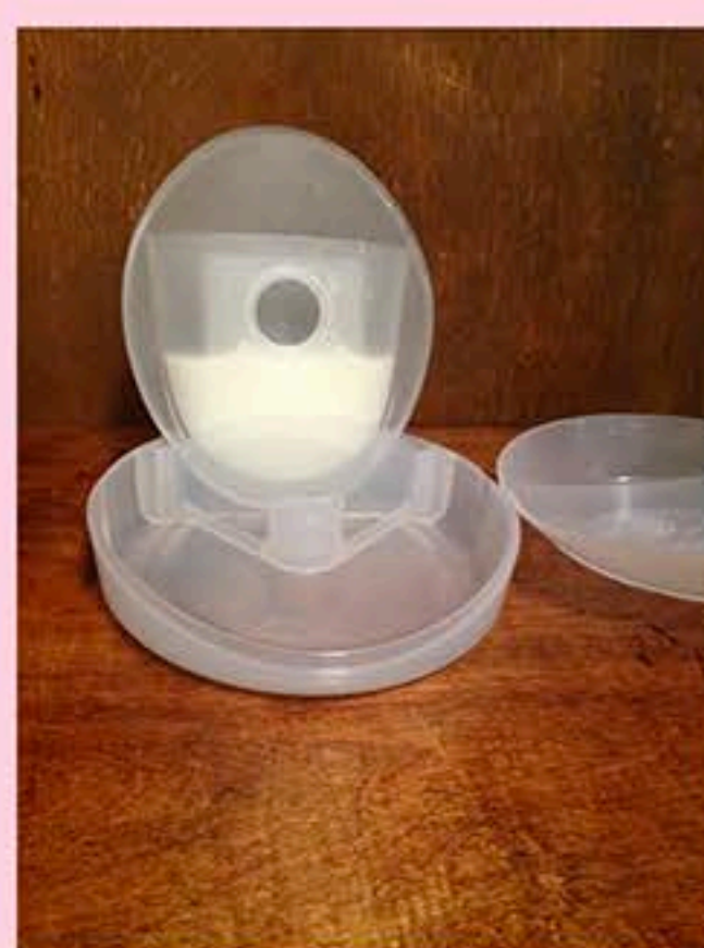
2 ounces of milk

Milkies Milk Saver is very easy to clean. You can hand wash it with warm water and soap. It air dries fairly quickly, or you can use a towel to dry it off.