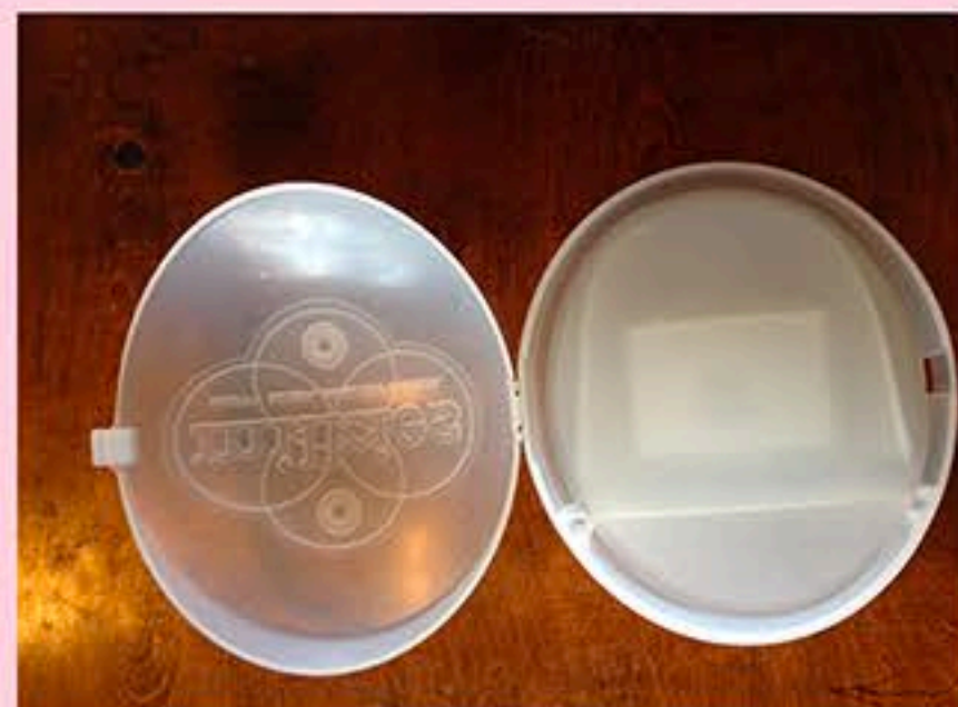
Milkies in the case

I absolutely LOVE this product! I used it multiple times a day for about a year. I am finally at the point where I do not leak every time I nurse. For those early days when I was leaking up a storm, this was a wonderful way to collect breast milk, and keep me from making a mess.